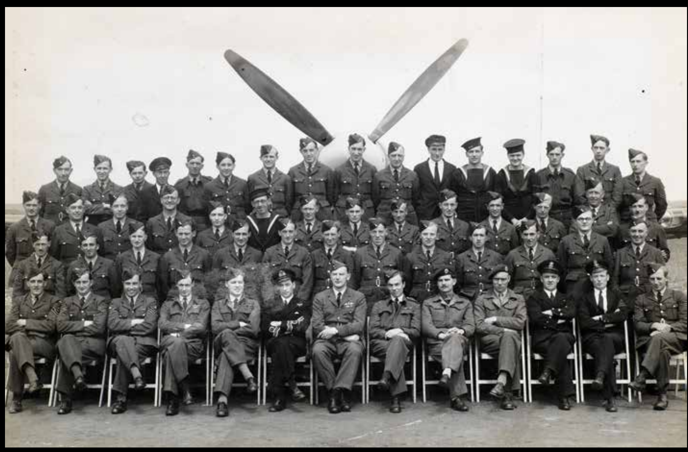
Aerodynamic Flight June 1945 R.A.E., Farnborough.